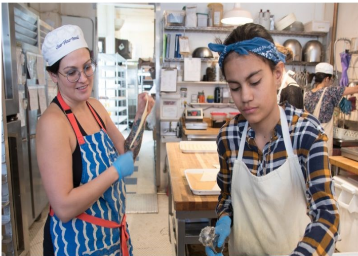
Apprentice Learning Shared Value in Action