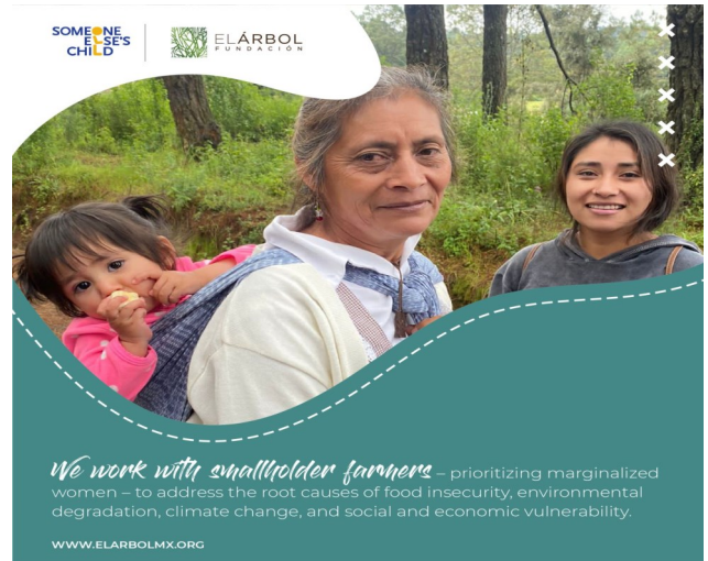
El Arbol Creating Opportunities in Mexico