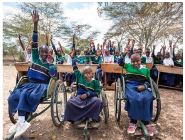
SEGA Tanzania Access to Quality Education for all