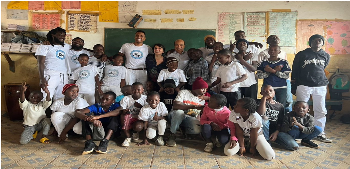
Inuka Cultural Center in Kenya A Visit From the Brazilian Ambassador