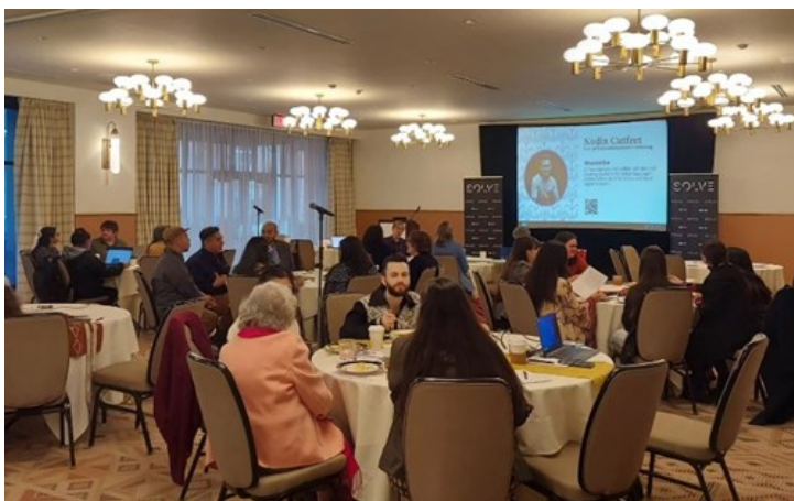
The 2024 MIT/Solve Indigenous Innovators Summit in Tucson