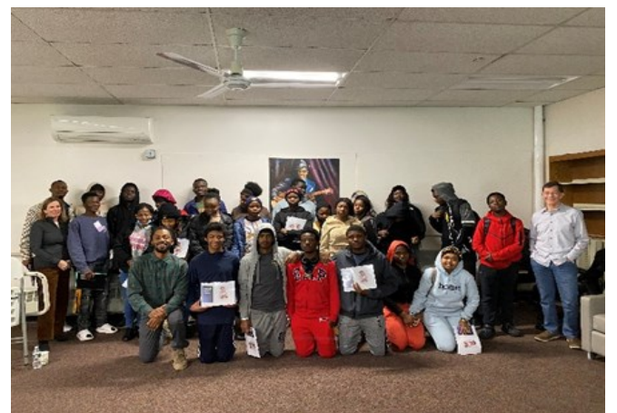
Financial Literacy Session at African Community Education (ACE) in MA

"Education is the kindling of a flame, not the filling of a vessel." Socrates