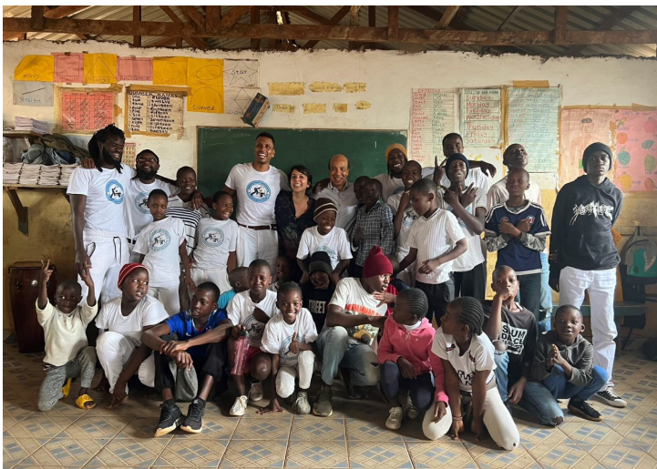
The Brazilian Ambassador to Kenya Visits the Inuka studio in Kibera