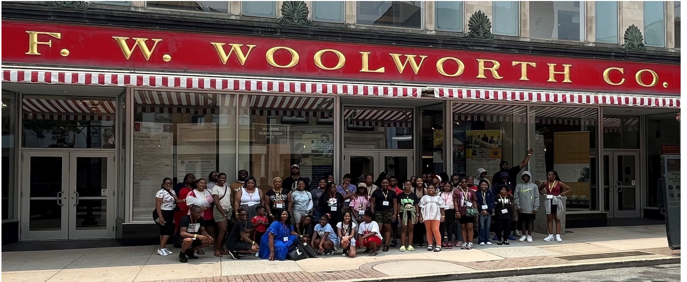
Smart From the Start Summer Pilgrimage visits the site of the lunch counter sit-in Greensboro